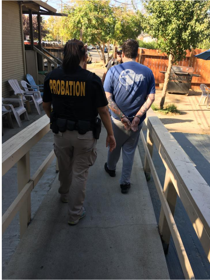
Deputy Probation Officer makes arrest during Operation Night Watch