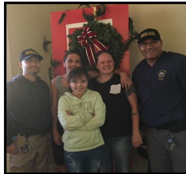
(Holiday gifts and meals for our clients)