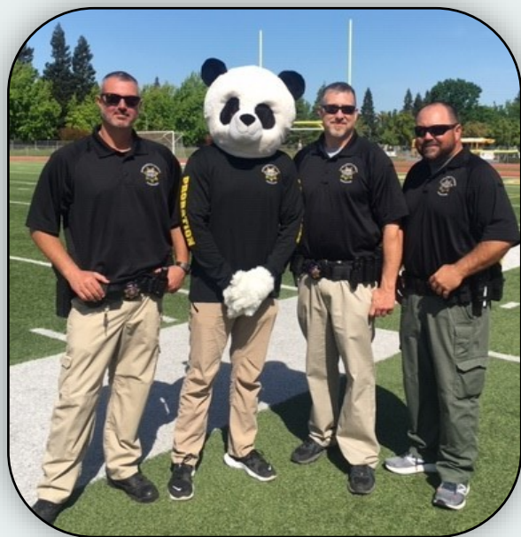
Community Based Supervision Officers helping with the 2019 Special Olympics.