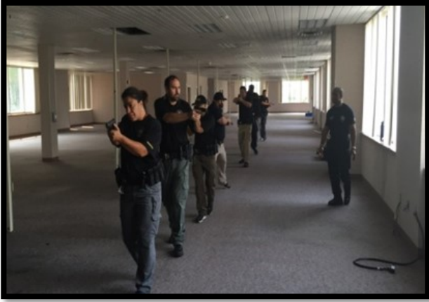
(School Active Shooter Training North Area Unit)