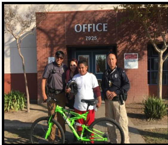
(DPO Parenzin working with the SSD Bike Program)