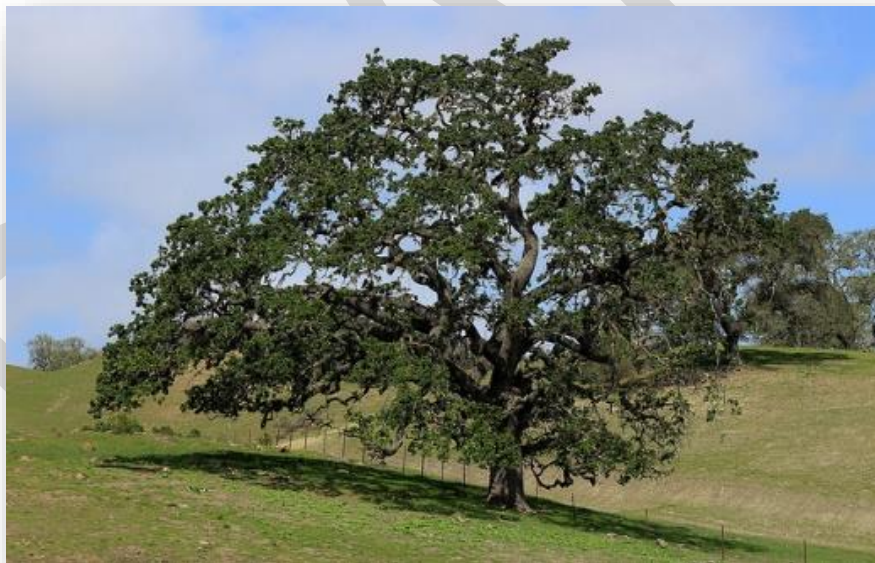
Valley Oak Youth Academy – The Valley Oak tree is native to the Sacramento area. It symbolizes lasting strength and endurance. The acorn of the tree symbolizes unlimited potential that something so small has the potential to grow into a large majestic oak tree. A tree mural is painted in the program-housing unit.

During initial orientation, a tree-focused activity identifies all the supports youth have when they enter the program. This visual tree continues to “branch” out with additional supports (e.g. family, advocates, providers, teachers, etc.) as they progress through the program. When youth leave the program, the visual reminds them they are not alone, they have support from many areas of their life, and they are growing into strong individuals capable of making healthy positive decisions that benefit themselves and the community.